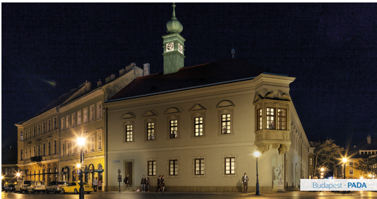
Budapest - PÁDA