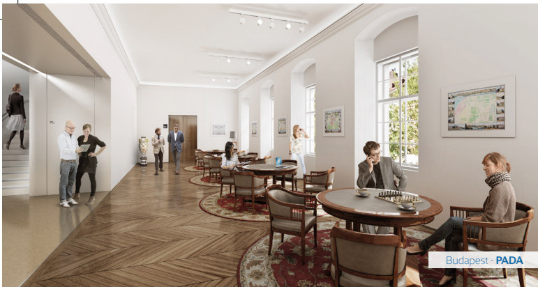
Budapest - PÁDA